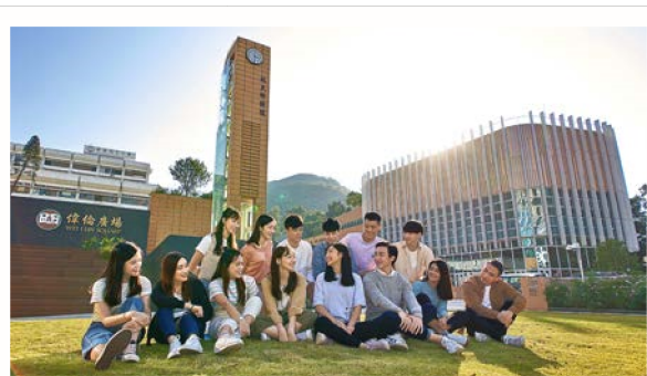
▲ The HA of HSUHK is a vibrant and supportive cradle of future leaders 恒大榮譽學院旨在培育未來領袖