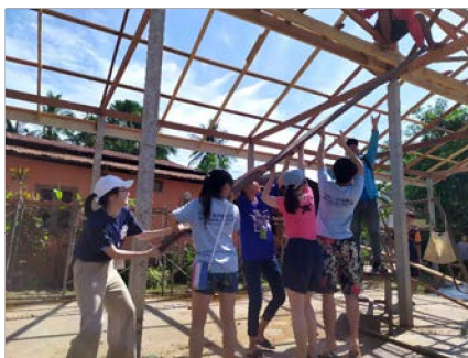
◀ HSUHK aims to equip students with global cross-cultural competencies and civic leadership. The photo shows HSUHK students helping to build a community centre in Laos. 恒大一向著重培育學生具備全球跨文化能力及公民領導力。圖為恒大大學生在老撾協助興建一所社區中心。

恒大榮譽學院的成立，將貫徹大學培育領袖專才，承擔服務及推進社會以及世界發展的使命。