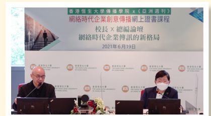
香港恒生大學傳播學院 x 《亞洲週刊》 網絡時代企業創意傳播網上證書課程 校長 X 總編論壇 網絡時代企業傳訊的新格局 2021年6月19日

HSUHK Business School Gala cum 10th Anniversary Junzi Corporation Award Presentation Ceremony 恒大商學院週年活動暨「君子企業大獎」 十週年頒獎典禮