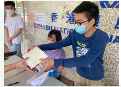
▲ Participants give the greeting cards and surgical masks to the disabled. 同學把心意卡連同口罩送給殘疾人士。

恒大義工隊（恒義）於 2021 年 1 月至 4 月與香港復康聯盟（康盟）合辦了「心意卡行動」，向殘疾人士送贈自行設計的心意卡展示愛與關懷。同學參與「殘疾人士的需要及相關支援政策」講座後，了解到殘疾人士的處境及困難，並設計精美心意卡，鼓勵殘疾人士在疫情下樂觀面對挑戰。