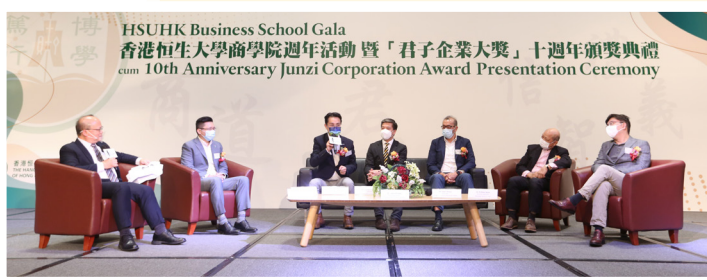
HSUHK Business School Gala 香港恒生大學商學院週年活動暨「君子企業大獎」十週年頒獎典禮 cum 10th Anniversary Junzi Corporation Award Presentation Ceremony

HSUHK Business School Gala cum 10th Anniversary Junzi Corporation Award Presentation Ceremony 恒大商學院週年活動暨「君子企業大獎」 十週年頒獎典禮