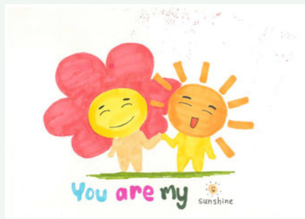
▲ Greeting card filled with blessings 充滿祝福的心意卡