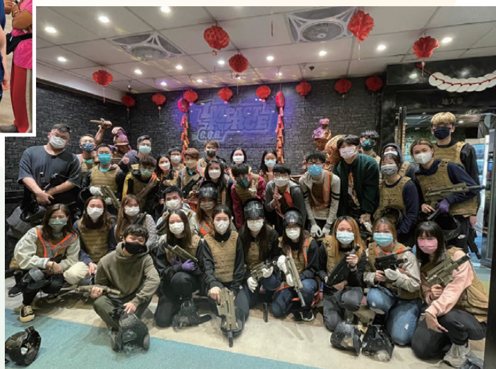
▲ Shooting game for team building of HA. 榮譽學院師生參與射擊遊戲，寓學習於遊戲，建立團隊精神。